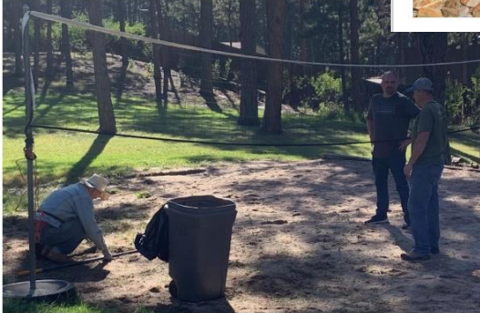
2023 BFLC Fall Workday