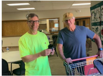
2023 BFLC Fall Workday

A great turn-out with 20 volunteers! Branches and trash were picked-up around the property, the drain by the outdoor worship area was cleaned, one main gutter was cleaned, weeding was done in the volleyball court, gardens and rock areas, pine needles and leaves were cleared from the window wells, mulch was added to the west garden and numerous flowers were planted (some were thinned), all exterior lights were checked, patio chairs and tables were brought into the basement (outside entrance) for winter storage and several unused appliances (freezers and refrigerators) and a desk were removed from the Black Forest Cares area (some items went to Habitat for Humanity). This group worked so quickly and efficiently the list of chores was completed before the pizza restaurant opened! A huge "thank you" to everyone involved.